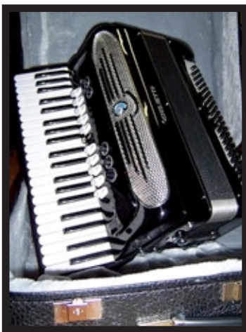
Giuletti FREE BASS Converter

Repairs to all types of Button and Piano Accordions Restoration and Reconditioning a speciality AFFORDABLE MODELS FOR BEGINNERS La Scala – Rosetti