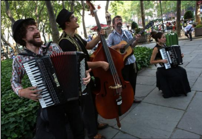
Les Poissons Voyageurs, a Montreal group, is one of the acts in the Accordions Around the World festival this summer in Bryant Park.

But the free Accordions Around the World festival at Bryant Park (New York) this summer is offering accordionists an opportunity to change the stodgy image of their instrument. Every Thursday through August from 5 p.m. onward, accordion players are stationed around the park, where they perform a varied repertory meant to show off their instrument’s versatility and range.