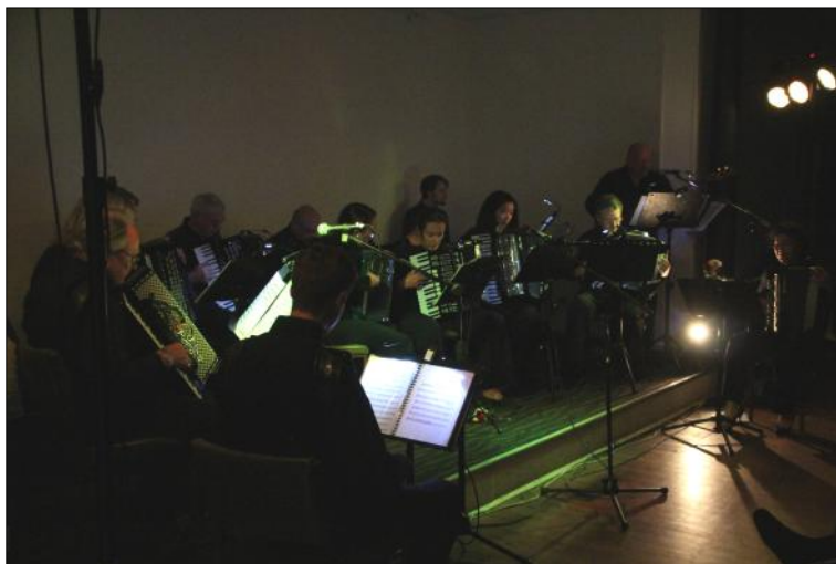
Players using mini torches above their stands

For the first time the orchestra played under coloured stage lights using battery operated mini torches attached to the music stands - interesting and a new challenge for everyone involved.