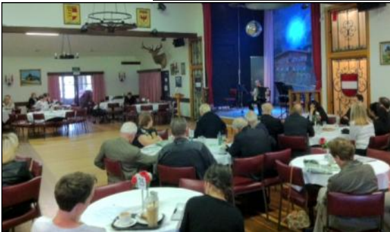
Audience enjoying a solo performer at the show