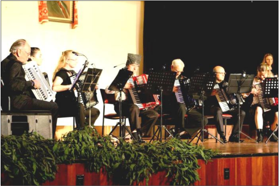
Melbourne Accordion Orchestra