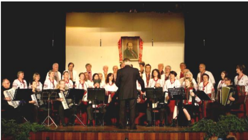
Ukrainian Choir with the Melbourne Accordion Orchestra