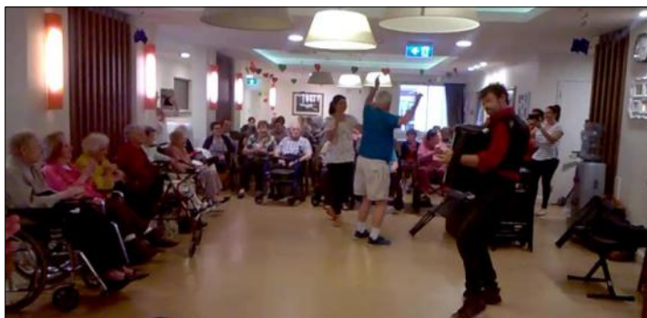
Residents enjoying the afternoon