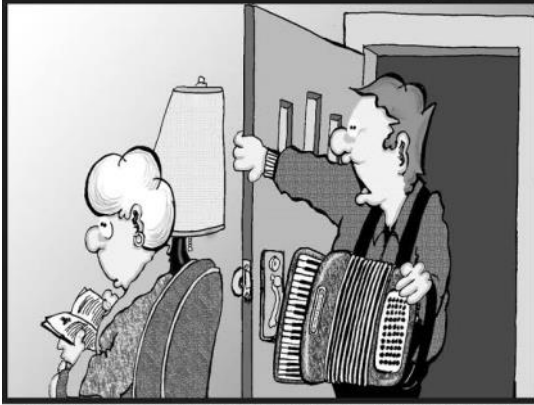
"I've landed a regular gig at the pub! – They want me to go on every night at five minutes to closing!!"