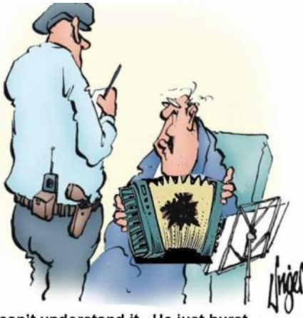
"I can't understand it. He just burst in here and shot my accordion."