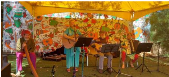
The Band performing at the Markets (minus the violinist) 2021