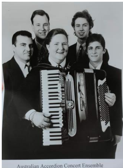
Australian Accordion Concert Ensemble