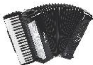
ROLAND V ACCORDIONS