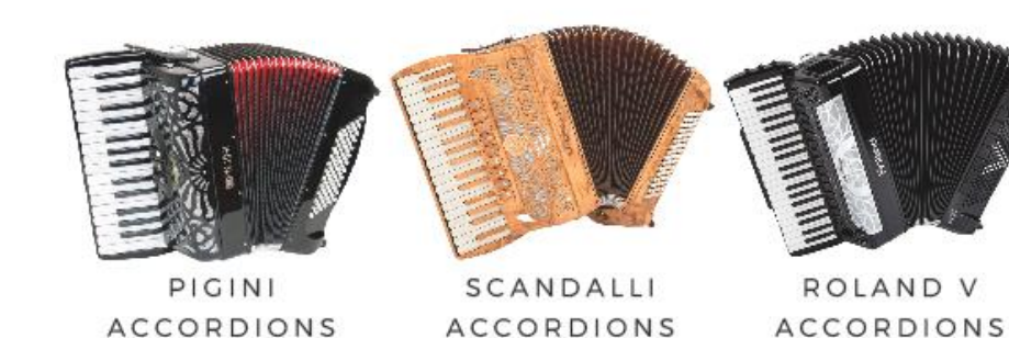
Large Range of: